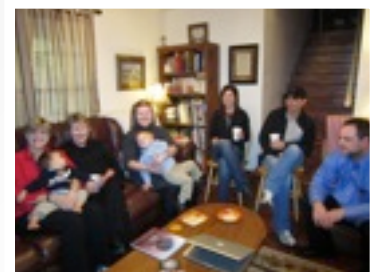
WE WERE ABLE TO SHARE ABOUT WHAT GOD IS DOING IN JAPAN!