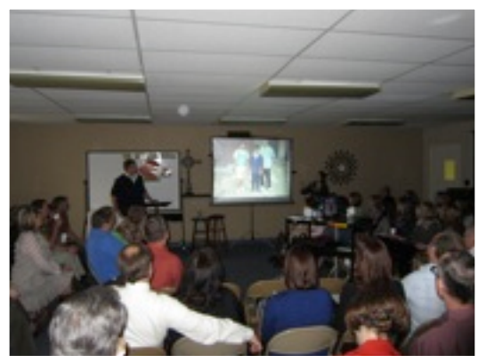
WE SPOKE IN SEVERAL SUNDAY SCHOOL CLASSES AT OUR SENDING CHURCH.