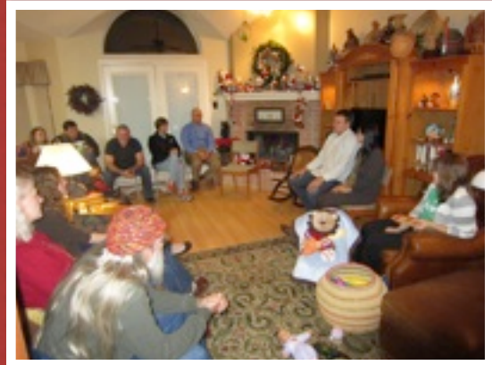
WE SHARED OUR STORY WITH OUR FRIENDS FROM THE MISSION TRAINING SESSION.