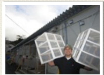
NEW DRAWERS FOR OUR FRIENDS