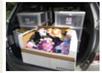
BACK OF OUR CAR

We are confident that the work done here is not in vain. Many are searching for answers. Please continue to pray for these people and that many will know Him. And please volunteer to help if you are able.