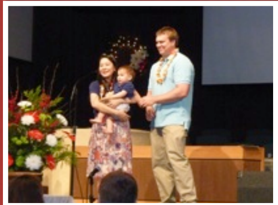
THE CHURCH IN HONOLULU INVITED US TO SHARE ABOUT OUR MINISTRIES.