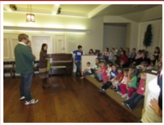
SAYING "THANK YOU" TO THE CHILDREN WHO HAVE BEEN PRAYING FOR US.