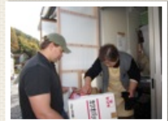
GIVING HER SOCKS