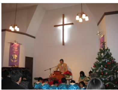
CHRISTMAS EVE SERVICE

Thank you so much for your continued prayers and support. We miss you all and thank God for each of you. We pray you all have a blessed new year!