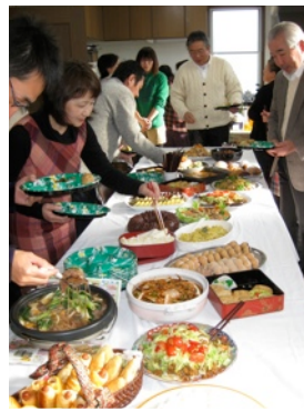
POTLUCK LUNCH AT CHURCH